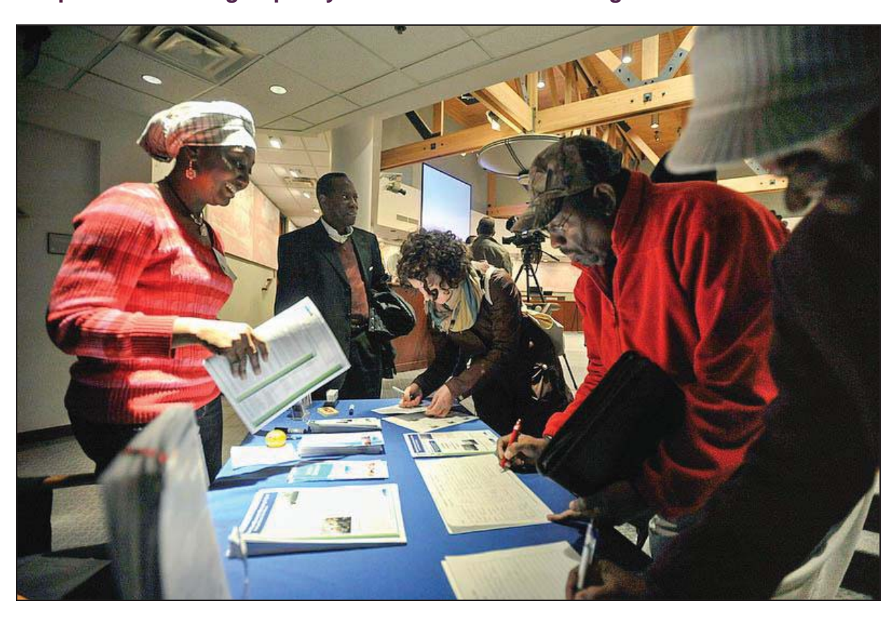
Chapter 11. Building Capacity to Be Effective Human Rights Advocates

When diaspora community members decide to take action to shape human rights conditions in their country of origin, they must also think about what they will need in order to be most effective. In a 2012 survey of diaspora community members from many different countries, The Advocates found that many felt that they would be more effective in their human rights work if they could access process-oriented training and capacity-building support. For example, many identified the need for resources on keeping their work secure and the basics of creating and operating a nonprofit organization. Others requested information about seeking assistance to address emergency situations affecting relatives and colleagues in their country of origin. This chapter is designed to address some of the questions that human rights activists in diaspora communities often ask about structural kinds of issues.