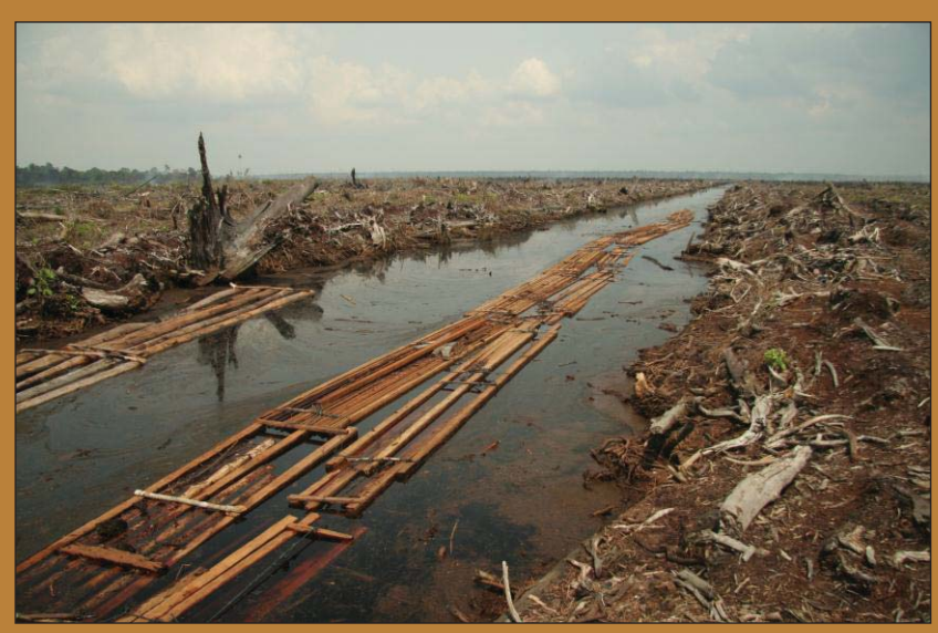
Deforestation to make way for an oil palm plantation in Riau Province, Indonesia

The CERD Committee expressed concern over the allegations and noted that the committee had issued a letter under its early warning and urgent action procedures in 2007, and that the Indonesian Government had never responded to the letter. In response to FPP's appeal, the committee again