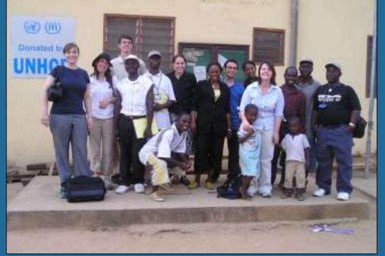
Pro bono statement-takers at the Buduburam Refugee Settlement in Ghana, with some of the Liberian refugees who gave statements for the Liberia TRC Diaspora Project

their own expenses to travel to Ghana to document the statements of Liberian refugees there. The U.S. public hearings were filmed by a volunteer film crew, while pro bono lawyers helped witnesses prepare to testify, psycho-social counselors provided support to the witnesses and court reporters transcribed the proceedings. In all, more than 28 law firms, academic institutions, community organizations, and nongovernmental organizations (NGOs) were involved as pro bono partners with The Advocates' Liberia TRC Diaspora Project.