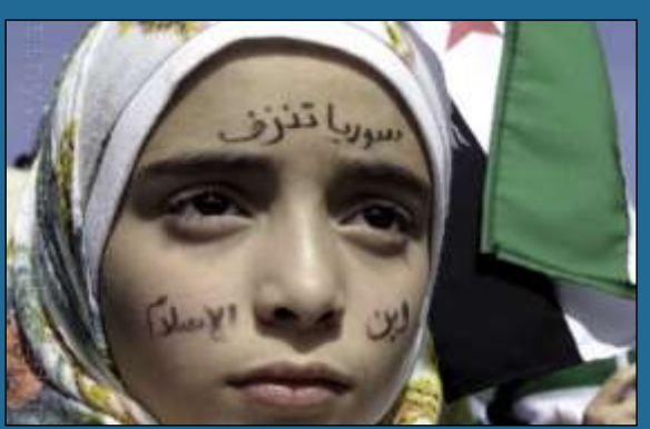
Syrians rally outside the U.S. Embassy in Amman, Jordan to demand a U.S. military intervention to stop the violence in Syria. Arabic writing on the girl's face reads: "Syria is bleeding. Where are the Muslims?"

In 2012, a group of Syrian-born activists and artists in the United States created an email listserve to raise awareness among the diaspora and others in the U.S. about the human rights abuses against civilians taking place during the conflict in Syria. Members of the Syrian diaspora, as well as others, could join the listserve by providing their email addresses. The group compiled and regularly distributed through the listserve news reports, links to amateur videos posted on YouTube, and other information about what was happening on the ground in Syria. They combined the use of the email listserve with public events such as poetry readings and artistic performances to raise