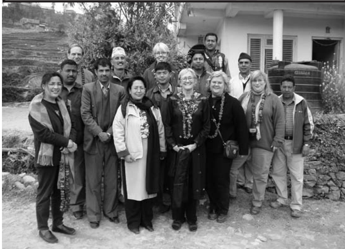
Minnesota Advocates team to Nepal with our Sankhu-Palubari Community School partners.