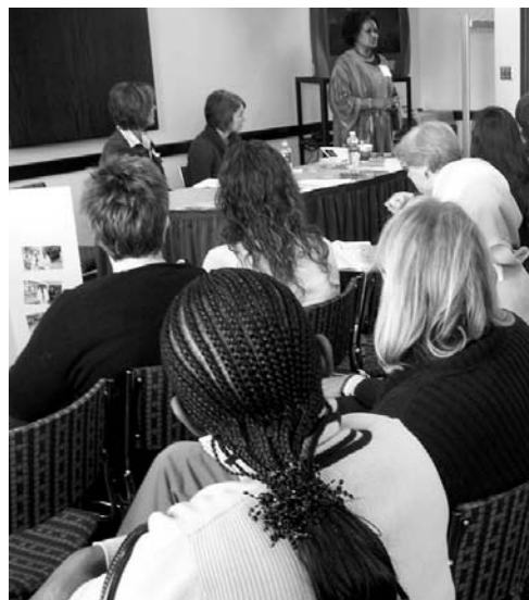
Speaking of African Women's Health workshop at IWD

In the closing performance, "Momentum: A Celebration of Resistance," Ten actors and a Taiko drummer portrayed how women view the world, altered by personal experiences and cultural ties. Despite being silenced by culture and economic forces, they continue to fight for a better future – leaving a legacy of empowerment, creating opportunities and giving women a voice.