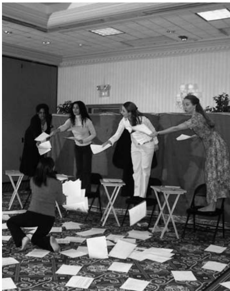
"Journey to Safety" performed by Pangea World Theater

The Women's Program, in collaboration with Pangea World Theater, has developed a new training which includes a theatrical piece, Journey to Safety , based on Minnesota Advocates' report, The Government Response to Domestic Violence Against Refugee and Immigrant Women in the Minneapolis/St. Paul Metropolitan Area . The report outlines the obstacles that battered refugee and immigrant women face when seeking protection and government services in the Twin Cities metropolitan area. The training begins with a twenty minute dramatic performance including five vignettes, highlighting obstacles such as language barriers, fear of deportation, and community pressures that must be overcome by battered refugee and immigrant women seeking protection. The performance is followed by a facilitated discussion of the findings of the Minnesota Advocates' report and strategies for addressing the problems.