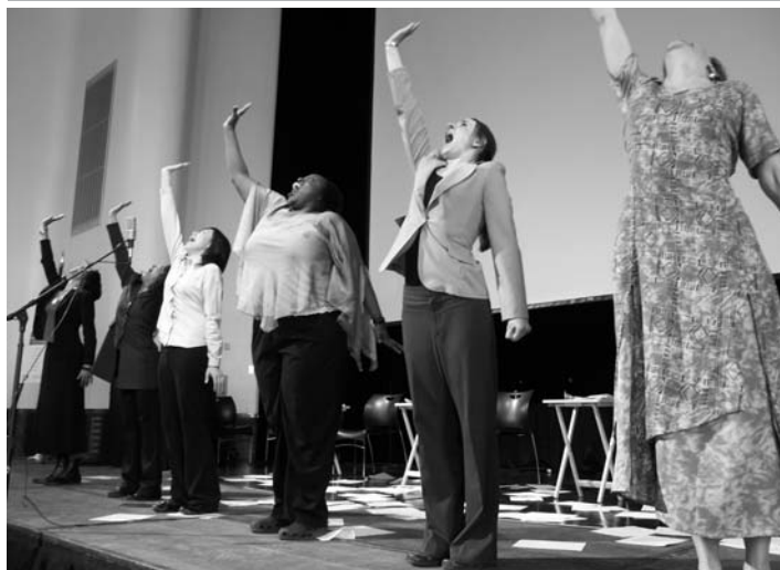
"Journey to Safety" by Pangea World Theater

Two performances by Pangea World Theater gave life to issues of women's human rights in