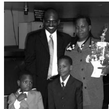
A Minnesota Advocates asylum client finally reunites with his family after over four years of separation

ments, such as birth, adoption and marriage certificates, while waiting for asylum to be granted. USCIS will also require recent photos of family members which the client should get as soon as asylum is granted. Finally, asylees should prepare financially to cover the costs of plane tickets and housing for their families as well as for the high cost of DNA testing, which consular posts sometimes require before issuing a visa.