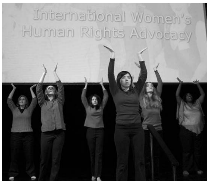
"Momentum: A Celebration of Resistance" by Pangea World Theater

with display and information tables at the event. The resources provided by this record number of co-sponsors gave ample opportunity for attendees to continue the momentum and inspiration of the day with further involvement and activism.