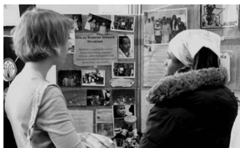
IWD participants visit the Minnesota African Women's Association display

Financial support for the event was provided by the Women's Foundation of Minnesota, TCF Bank, and the following groups at the University of Minnesota: Office for University Women; Institute