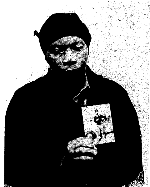
Mother whose son was killed by police in Soweto, South Africa.