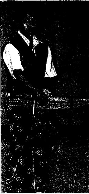
Above: A youth from the Hmong Cultural Center entertains meeting participants.