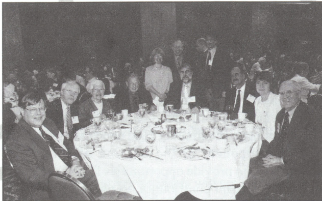
Minnesota Advocates supporters enjoying dinner