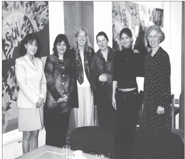
Minnesota Advocates Women's Program staff and volunteers with Bulgarian women's advocates and Bulgarian legislators.

The Bulgarian law passed on its first reading before the Bulgarian parliament on June 30, 2004, and is expected to become law following its second reading in the fall of 2004. The law is a landmark achievement for Bulgarian women and for women throughout the region. It is also an example of the effective use of