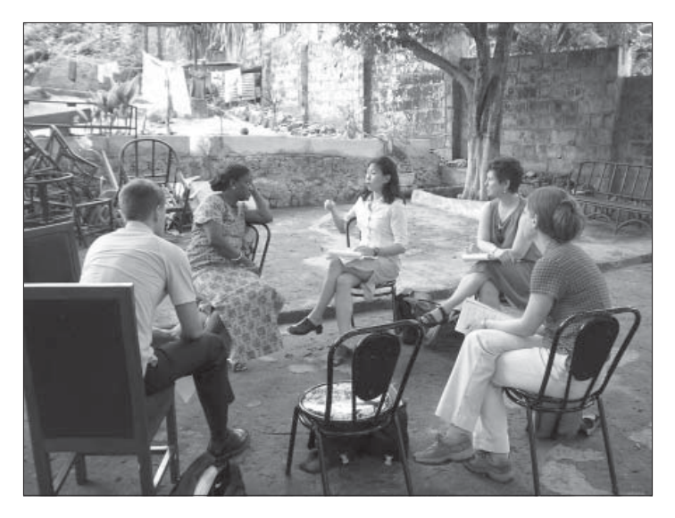
Minnesota Advocates staff and volunteers conducting fact-finding interview in Freetown, Sierra Leone.

by bringing it to the attention of the international community. In the end, human rights monitoring also puts pressure on the government to comply with the truth commission's recommendations.