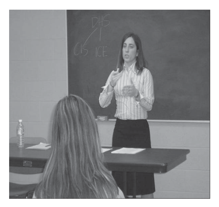
As part of the Battered Immigrant Women Documentation Project's education and advocacy efforts, Minnesota Advocates provided training on immigration law at the Central Minnesota Conference on Domestic Violence and Immigration (April 2004).

ticular needs of refugee and immigrant victims of domestic violence. International law is the standard used, rather than the extent of the government's protection of and provision of services to nonimmigrant women. The project's Steering Committee guided the report drafting process, reviewed and provided feedback on the report, and made recommendations for final follow-up interviews. The Steering Committee also provided Minnesota Advocates with advice concerning strategies for the release of the report as well as the response Minnesota Advocates would likely receive to the report from government and community organizations, including immigrant community organizations.