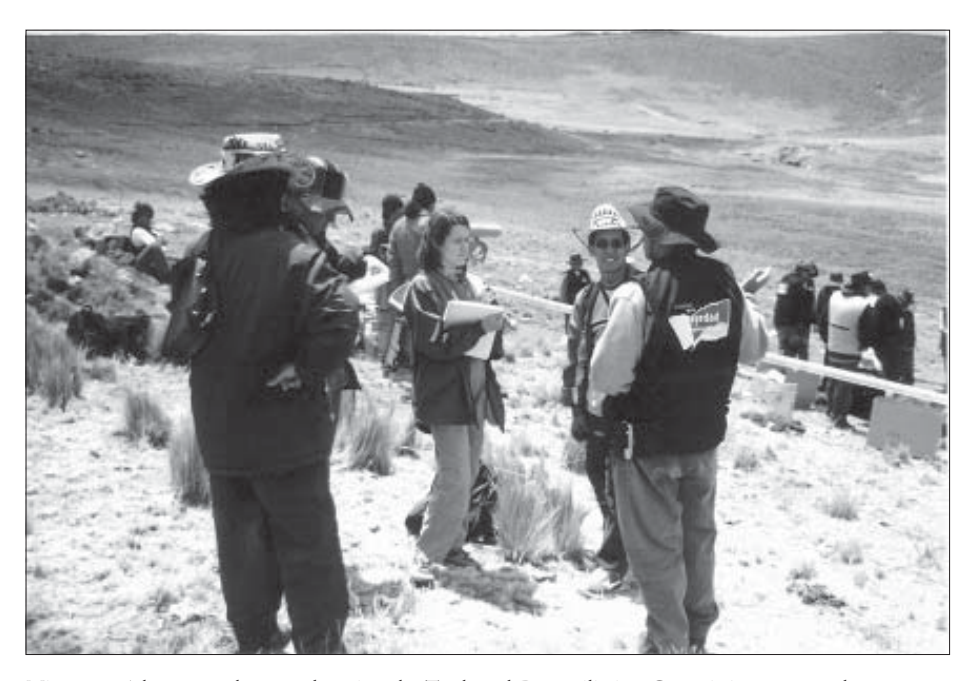
Minnesota Advocates volunteer observing the Truth and Reconciliation Commission-sponsored exhumations of mass graves in Lucanamarca, Peru.

Human rights monitoring can play a vital role in the success of transitional justice processes. Human rights monitors' investigations and published observations uphold the integrity of the process; monitors provide moral and emotional support for victims who make the difficult decision to provide testimony; and monitors further legitimize the transitional justice process