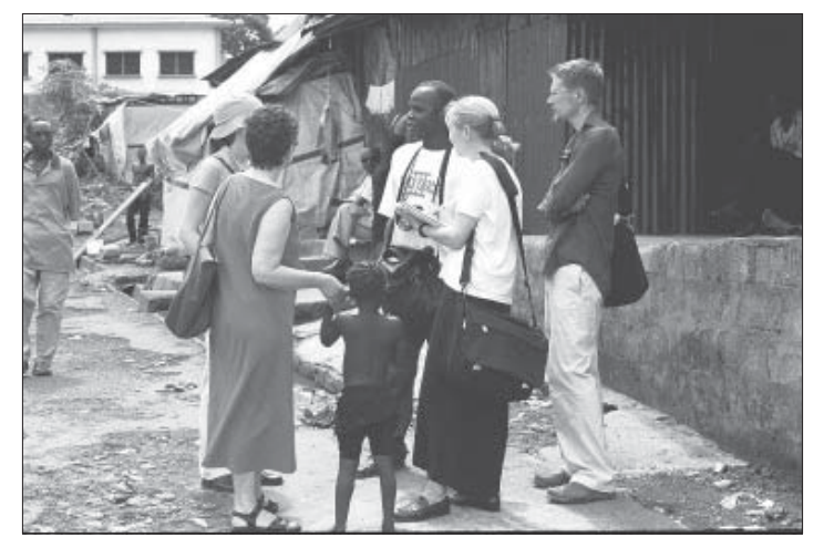
Minnesota Advocates team conducting on-site investigation of conditions at an amputee camp in Sierra Leone.