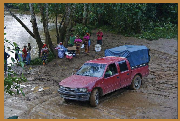
Flooding in a Kuna community in Panama

and Emberá Indigenous People of Bayano and their members against the State of Panama to the Inter-American Court. The State of Panama had failed to pay economic compensation to the indigenous peoples for the dispossession and flooding of their ancestral territories stretching back as far as 1969. The Inter-American Commission chose to refer the case to the Inter-American Court in order to push for compensation and to mandate that the State of Panama work to preserve the human rights of the indigenous groups, including by returning them to their ancestral lands.860