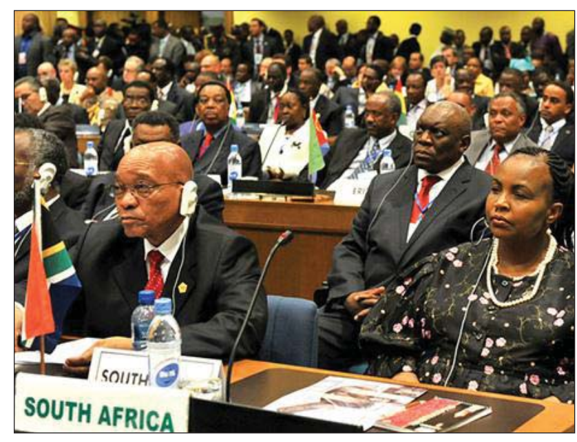
A meeting of the African Peer Review Forum in Addis Ababa, Ethiopia in January 2011

stakeholders who participated in the process to monitor implementation of the Program of Action and any additional strategies to address concerns raised in the report. 965