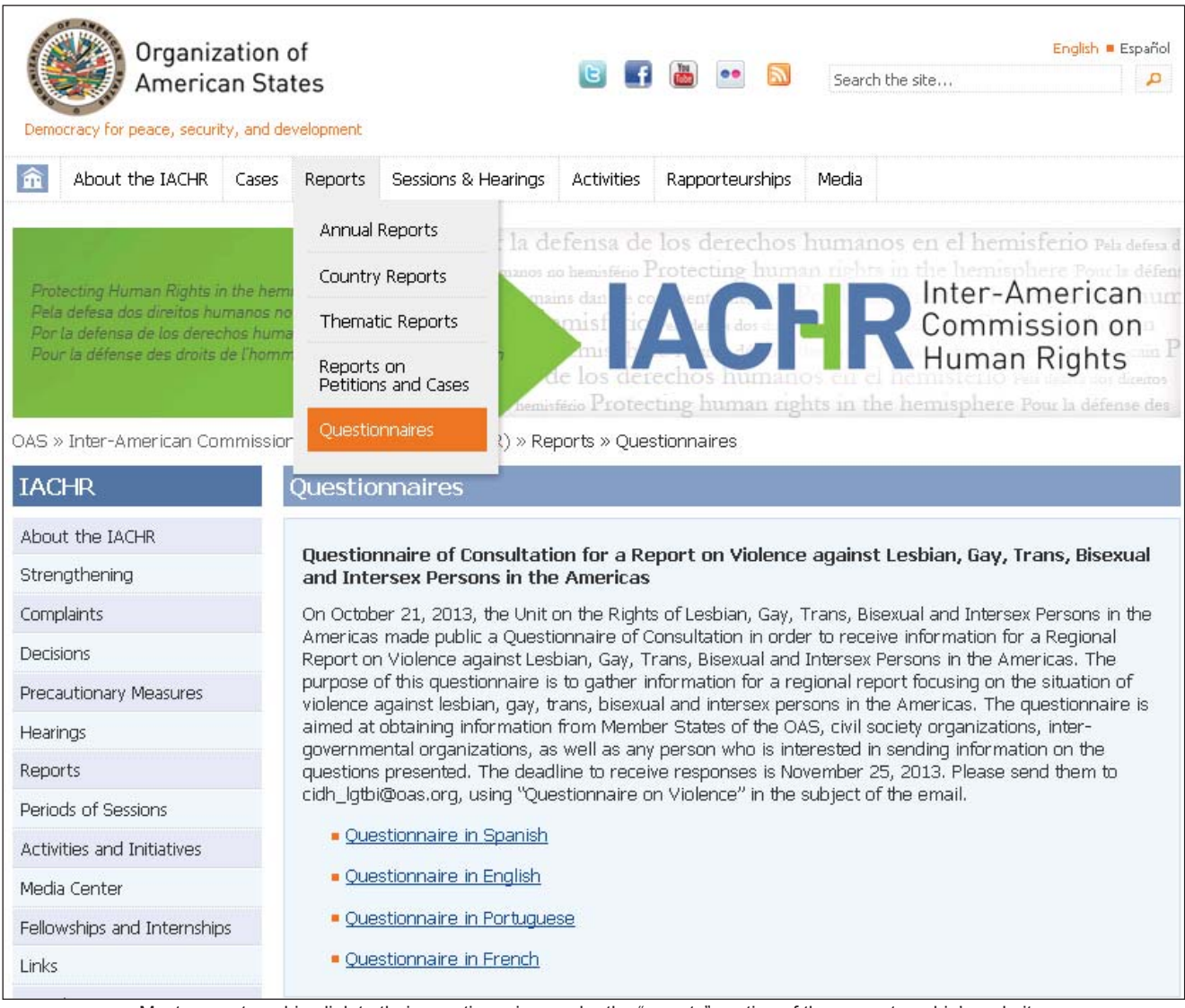
Most rapporteurships link to their questionnaires under the "reports" section of the rapporteurship's website.