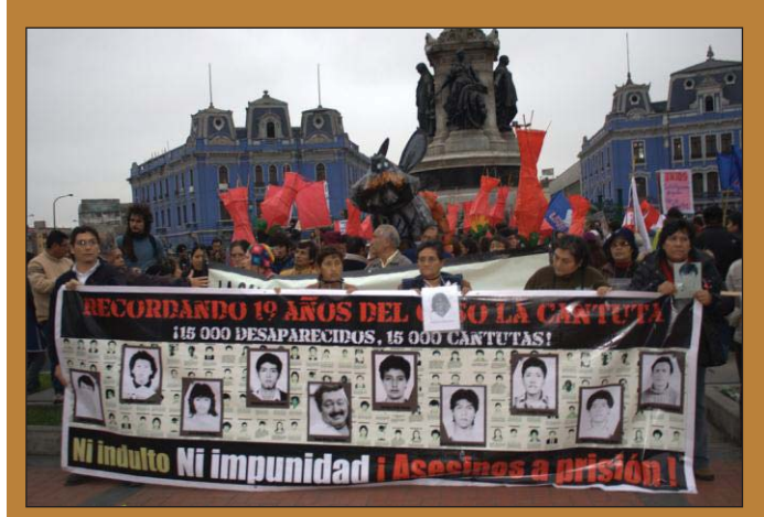
Family members of the victims of the Cantuta Massacre march against impunity in 2011

The Center for Justice and International Law (CEJIL) works for the protection and promotion of human rights in the Americas by responding to human rights abuses committed by state officials, fighting impunity, reducing inequality and exclusion in the region through the right to equality and respect for human dignity, strengthening rule of law, democracy, civil society, and increasing the effectiveness of the Inter-American system and access to justice. CEJIL was founded in 1991 by a group of human rights defenders in Caracas, Venezuela. It now has offices in Buenos Aires, Argentina; Rio de Janeiro, Brazil; San Jose, Costa Rica, and Washington, D.C.