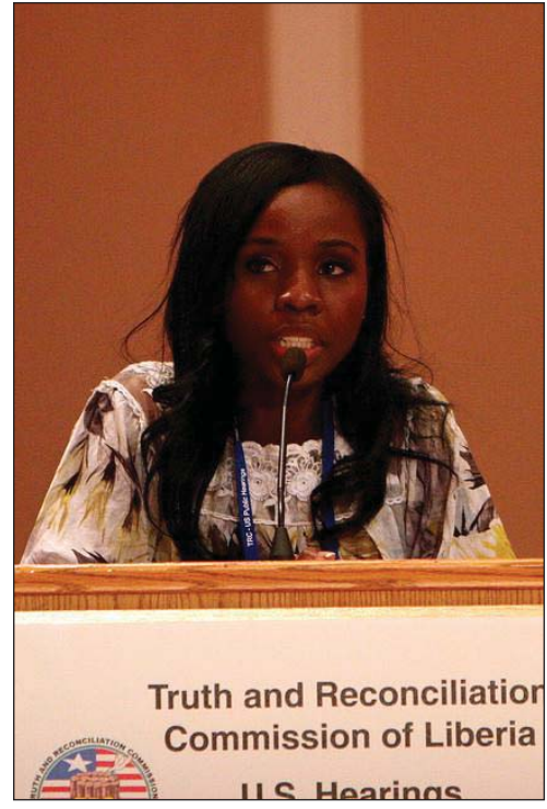
A member of the Liberian Women's Initiative of Minnesota testifying at the first ever public hearings of a truth commission held in a diaspora venue, the Diaspora Hearings of the Liberia Truth and Reconciliation Commission, at Hamline University in St. Paul, Minnesota, in June 2008.

Yet the role that diaspora communities can play in improving human rights around the world has been largely overlooked in the human rights field. With this project, The Advocates aims to create tools to help tap the underexplored resources of diaspora involvement in human rights.