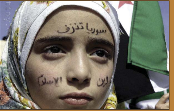
Syrians rally outside the U.S. Embassy in Amman, Jordan to demand a U.S. military intervention to stop the violence in Syria. Arabic writing on the girl's face reads: "Syria is bleeding. Where are the Muslims?"

In 2012, a group of Syrian-born activists and artists in the United States created an email listserve to raise awareness among the diaspora and others in the U.S. about the human rights abuses against civilians taking place during the conflict in Syria. Members of the Syrian diaspora, as well as others, could join the listserve by providing their email addresses. The group compiled and regularly distributed through the listserve news reports, links to amateur videos posted on YouTube, and other information about what was happening on the ground in Syria. They combined the use of the email listserve with public events such as poetry readings and artistic performances to raise