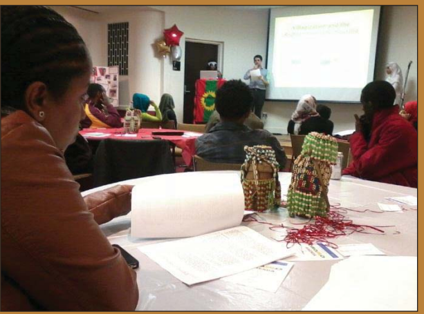
A volunteer attorney makes a presentation to an Oromo student group at the University of Minnesota about the findings of a report to the UN Committee on Economic, Social and Cultural Rights, based on The Advocates' remote monitoring report.

The project methodology focused on interviews with members of the Oromo diaspora, as well as service providers, scholars and others working with Oromos. The Advocates assembled a group of ten lawyers, many of whom had worked on behalf of Ethiopians' asylum claims in the past, and trained them on fact-finding, documentation, and interview techniques, including a review of human rights violations against the Oromo and the current country conditions in Ethiopia. The fact-finders conducted interviews with Oromo people in the diaspora, Oromo scholars and community leaders, the immigration bar, and providers of medical and community services to the Oromo.