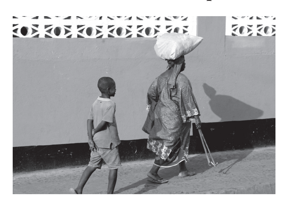
Human Rights Abuses during the Rice Riots and Doe Era