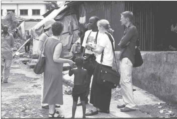
Minnesota Advocates team conducting on-site investigation of conditions at an amputee camp in Sierra Leone.