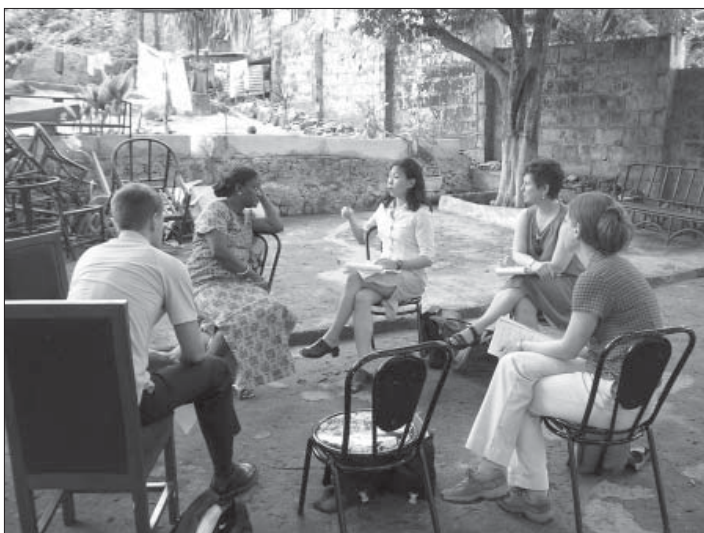
Minnesota Advocates staff and volunteers conducting fact-finding interview in Freetown, Sierra Leone.

by bringing it to the attention of the international community. In the end, human rights monitoring also puts pressure on the government to comply with the truth commission's recommendations.