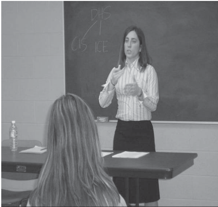
As part of the Battered Immigrant Women Documentation Project's education and advocacy efforts, Minnesota Advocates provided training on immigration law at the Central Minnesota Conference on Domestic Violence and Immigration (April 2004).

ticular needs of refugee and immigrant victims of domestic violence. International law is the standard used, rather than the extent of the government's protection of and provision of services to nonimmigrant women. The project's Steering Committee guided the report drafting process, reviewed and provided feedback on the report, and made recommendations for final follow-up interviews. The Steering Committee also provided Minnesota Advocates with advice concerning strategies for the release of the report as well as the response Minnesota Advocates would likely receive to the report from government and community organizations, including immigrant community organizations.