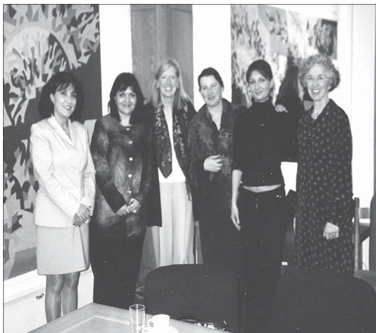
Minnesota Advocates Women's Program staff and volunteers with Bulgarian women's advocates and Bulgarian legislators.

The Bulgarian law passed on its first reading before the Bulgarian parliament on June 30, 2004, and is expected to become law following its second reading in the fall of 2004. The law is a landmark achievement for Bulgarian women and for women throughout the region. It is also an example of the effective use of