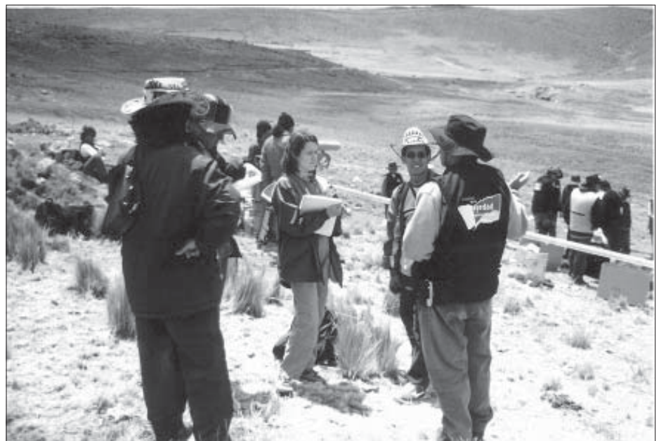
Minnesota Advocates volunteer observing the Truth and Reconciliation Commission-sponsored exhumations of mass graves in Lucanamarca, Peru.

Human rights monitoring can play a vital role in the success of transitional justice processes. Human rights monitors' investigations and published observations uphold the integrity of the process; monitors provide moral and emotional support for victims who make the difficult decision to provide testimony; and monitors further legitimize the transitional justice process