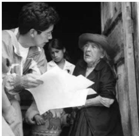
Interviewing Peruvian human rights victims for the Truth and Reconciliation Commission.