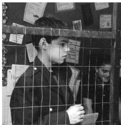
Incorporating human rights themes in the classroom (left) a student participates in a refugee camp reenactment at Sandburg Middle School.