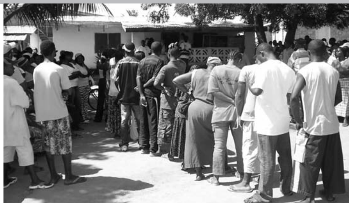
Lines of people waiting to give statements in the Buduburam refugee settlement in Ghana