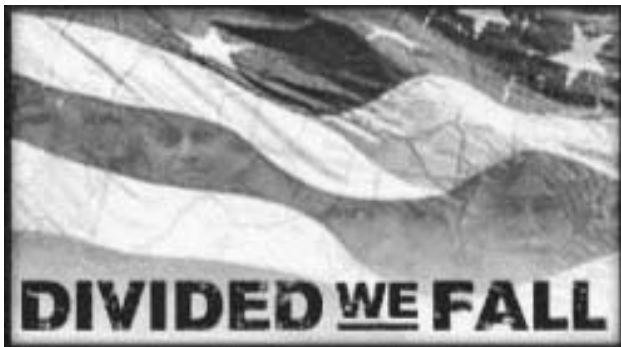
Divided We Fall video

This year, Minnesota Advocates for Human Rights commemorated the signing of the Universal Declaration of Human Rights by focusing on the long-term impact of 9/11 on refugees, immigrants, and religious minorities. In collaboration with the Human Rights Center at the University of Minnesota, Minnesota Advocates held a day-long CLE on December 3, 2007 with plenary sessions, workshops, and training sessions and held an evening showing of the documentary “Divided We Fall: Americans in the Aftermath.” The CLE, “Voices From Silence: September 11 and the Impact on Refugees, Immigrants, and Religious Minorities” highlighted the findings of Minnesota Advocates’ report Voices From Silence: Personal Accounts of the Long-Term Impact of 9/11 , issued in 2006. Topics addressed in workshops included the history of nativism and its impact in