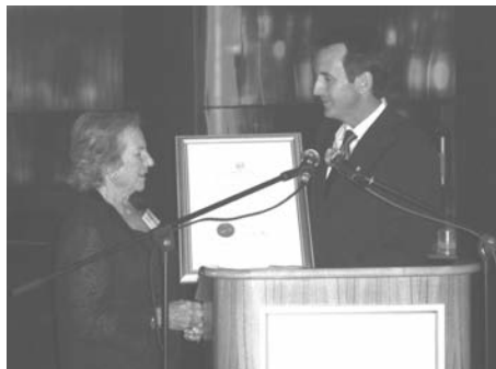
Gov. Tim Pawlenty presenting an award to Ethel Kennedy

Minnesota has a strong history of people devoted to human rights work. The state is recognized across the globe for its human rights advocacy. In honor of this work, September 30 - October 6 was declared "Human Rights Week" in Minnesota.