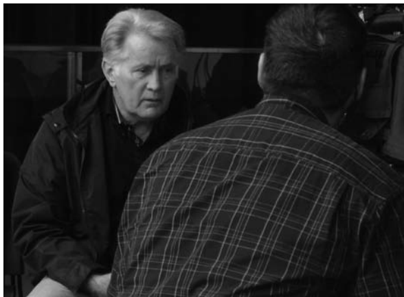
Martin Sheen engaging in discussion before the Speak Truth to Power performance