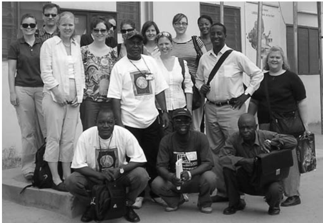
Week One team with Liberian statement colleagues in front of Liberian Refugee Welfare Council building

Minnesota Advocates staff, along with more than 20 volunteers from around the United States, traveled to the Buduburam refugee settlement outside of Accra, Ghana as part of the Liberian TRC's Diaspora Project. The Liberian TRC is the first such body to systematically engage its refugee population in the statement-taking effort. Working in tiny one-room homes, on doorsteps, on benches under trees, and occasionally in an office with a fan, the Minnesota Advocates team worked tirelessly to document hundreds of statements from Liberian refugees living in Ghana.