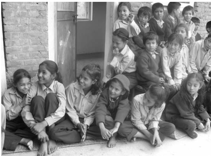
Students at the Sankhu-Palubari Community School in Nepal

Sponsored by Minnesota Advocates since its inception, the Sankhu-Palubari Community School in Nepal added the eighth grade this year, increasing its student body to 225. We will be celebrating the first graduation from the school in the spring. The school provides free quality education and a daily meal to the region's poorest students, including girls who are often expected to give up school to earn money as domestic workers. The opportunity to go to school provides children their fundamental right to education and prevents them from working as child laborers in the exploitative working conditions common in Nepal.