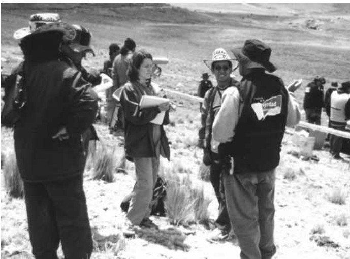
The Minnesota Advocates Peru team visited mass grave sites at Lucanamarca.

The Peruvian commission held numerous public hearings, exhumed three mass graves and interviewed more than 17,000 individuals, many of them in isolated mountain villages. It concluded that the Sendero Luminoso (Shining Path), an armed insurgent group, was the principal perpetrator of crimes and violations of human rights. Sendero Luminoso bears responsibility for 54 percent of the reported victim deaths. A second armed insurgent group, the Tupac Amaru Revolutionary Movement (MRTA) was responsible for an additional 1.5 percent of victim deaths.