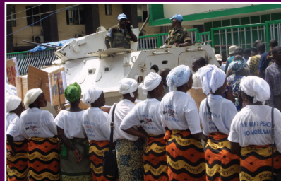
Protesting in front of UN Envoy at Mamba Point, Monrovia, Liberia.

Inspired by the U.N. Fourth World Conference on Women held in Beijing, the 15th Annual International Women's Day event will celebrate the diversity of Minnesota women, highlight advancements in women's rights and equality, encourage activism, and educate participants about human rights issues that affect girls and women locally, nationally, and internationally. This year we welcome Leymah Gbowee, a remarkable woman who led the women of Liberia to demand peace and justice for themselves and for their country – an embodiment of our 2010 theme, Inspire. Act. Change! As Caroline Kennedy noted when presenting the Profile in Courage Award to Leymah Gbowee and the women of Liberia, "Their courage has given the women of the world a blueprint for meaningful political change."